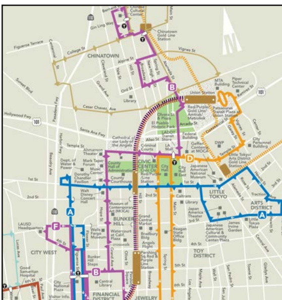
Current DASH Routes.

Information and Surveys available at: http://ladottransit.com/Movingforwardtogether