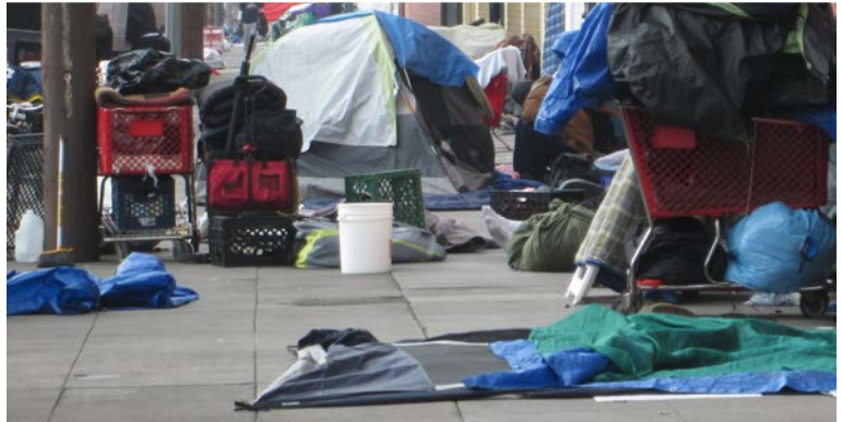
Encampments blocking public right of way on the 500 block of Towne Ave

Los Angeles Municipal Code 56.11 deals with an issue our district faces daily: complete blockage of public sidewalks and tents or tarpaulins attached to private property. The City Attorney's office recently revised LAMC 56.11, and the new version was heard by the Public Works and Gang Reduction Committee on May 20th. In that meeting City Attorney Flores stated that "the revised 56.11 strikes a balance between rights of homeless and rights of residents and businesses." Current ordinance allows persons to be cited for leaving property on public sidewalks; revised ordinance would allow persons to claim their property without fear of citation. The ordinance would apply to all persons, including businesses, and not just homeless individuals. The City has halted enforcement of 56.11 since the Lavan Vs. City of Los Angeles case, when it became clear that a more balanced approach to this issue was necessary. Many at City Hall believe this revised ordinance is the answer. Continued pg. 3